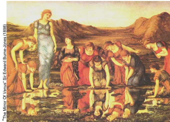
"The Mirror Of Venus" Sir Edward Burne-Jones (1898)

"I love this painting because of how well it represents my own work: a coming together of powerful women who have the courage to discover themselves in the mirror of truth and love."