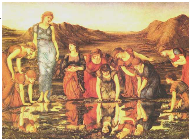
“The Mirror Of Venus” Sir Edward Burne-Jones (1898)

“I love this painting because of how well it represents my own work: a coming together of powerful women who have the courage to discover themselves in the mirror of truth and love.”